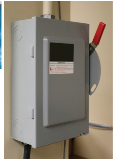
If fiberglass rescue hooks are not available, turn off all electrical power and call 911.