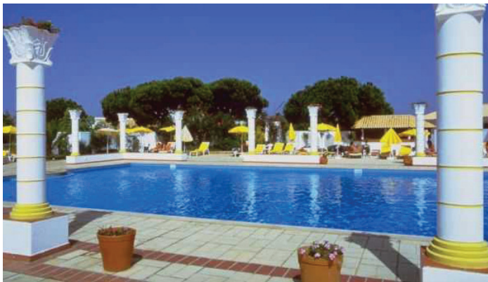
Swimming pools are enjoyed by millions of people around the world each year.

Raleigh, N.C.: On Labor Day weekend 2016, one such fatality occurred when a swimming pool became electrified due to a faulty water-pump connected to a deteriorated electrical system. The electrical system had not been tested/inspected for approximately three decades.