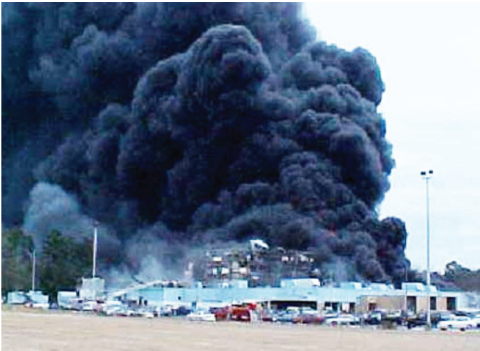
A fire burns following an explosion of fine plastic powder.

In North Carolina, an explosion of fine plastic powder used in the manufacture of polyethylene products killed six people and injured 38. In Pennsylvania, wood dust in a particle board manufacturing plant explosion killed three and injured 10. In Mississippi, rubber dust exploded in a rubber manufacturing plant, killing five and injuring 11. Also, in Kansas, a series of wheat-dust explosions in a large grain storage facility resulted in the deaths of seven people. Accident investigators in each of these facilities, although different industries, found similar conditions that resulted in a massive, tragic dust explosions.